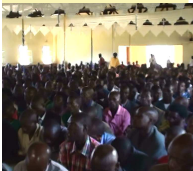
Part of the crowd of pastors and delegates at our Pastor's Conference in Rukomo, Rwanda