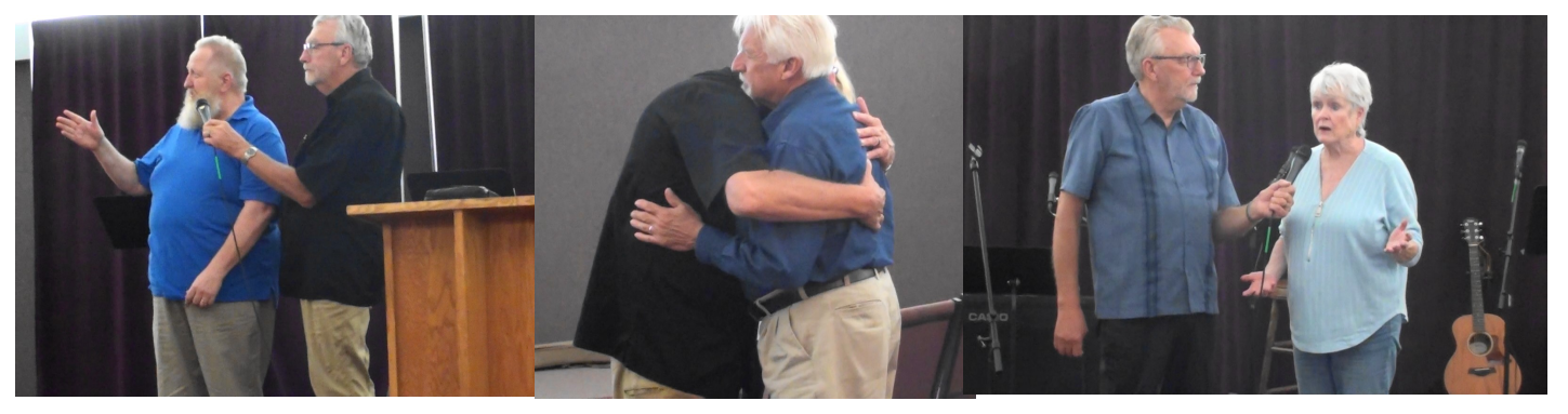
This man is testifying of his healing from vertigo and swelling of his ankles.

From July 28 to August 1 we held a Healing Festival at Cornerstone Christian Church, Emily, MN. God moved powerfully among the young people as an 18-year-old girl was set free from panic attacks and severe anxiety. A 19-year-old young man was set free from demonization and stopped cutting himself.