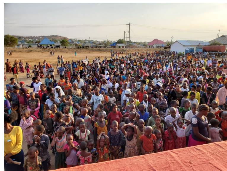
Part of the crowd at our Healing Festival at Kahama, Tanzania on September 23, 2021

We sent a team to Kahama, Tanzania to proclaim, "The Kingdom of Heaven is at Hand." We sensed in our spirits that God was stepping His foot into Kahama. "Why are you here Lord; what are you going to do?" We would soon find out. Many were healed of stomach and back pain. One young girl