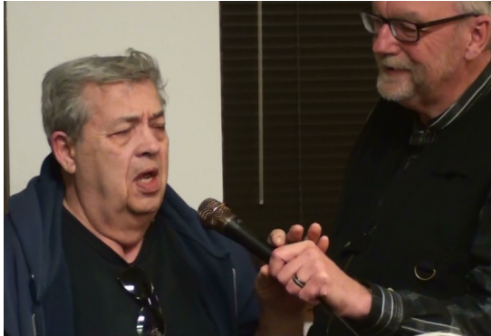
At right, the saints praying for the sick in Rush City, MN

Friday Night Fire happens the last Friday of each month this year.