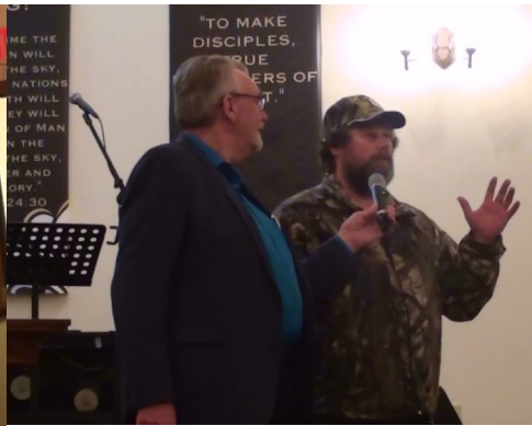
This man set out to complete his assignment to minister Jesus to someone in Redwood Falls, MN. He experienced two rejections, but then found a woman in deep emotional distress who received ministry freely.