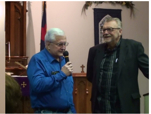
This man was healed in our meeting last year, but now he received such a download of the Father's love that he was able to minister that love to a single mom of three children in Grand Forks, ND

Please Pray. . . Call ahead to verify the times and places we will be ministering in the weeks ahead—come join us!