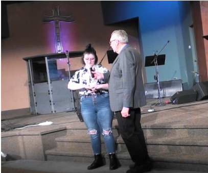
This young lady had a severe trauma to her right hand with pain for 5 months, now completely healed at Inver Hills Church, Inver Grove, MN