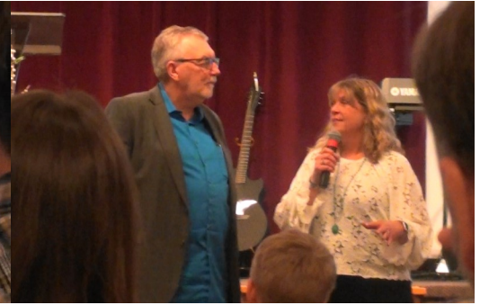
This lady is testifying for another young woman who was told last year that she could not bear children. We prayed and prophesied over her last March at New Life A/G in Sparta, WI. She now has the baby