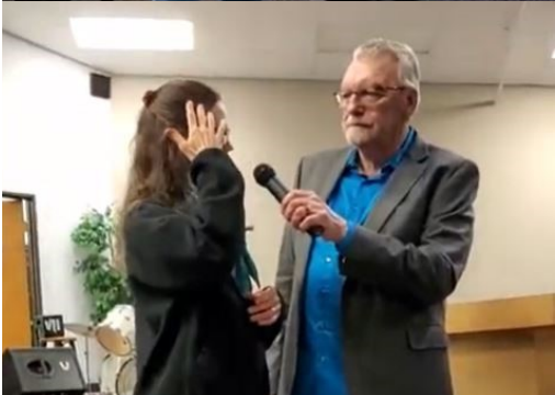
At left, this lady had a traumatic brain injury and came to the meeting with a heavy headache because of it. The headache left; she is healed in Sherburn, MN.