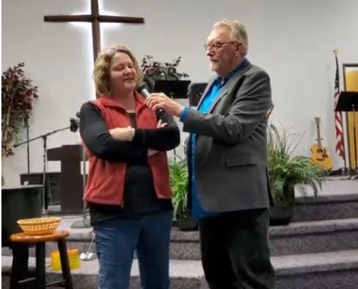
At left, this lady received such a download of the Father's love that she felt her daughter heart being restored from the inside out in Sherburn, MN.

Jesus is still healing people today. Below is a pictorial summary of healings that happened in the last three months in Sherburn, MN, Sparta, WI, and Ramsay, MI.