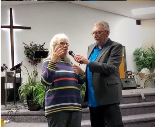
At left, this lady received a healing in her eyes in Sherburn, MN. Infection drained out of her eyes when she got home that night.