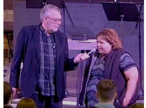
At right, this lady was delivered of demons publicly three years ago. She is prospering in her walk with the Lord in Ramsay, MI. This picture is used with her permission.

Please Pray... Call ahead to verify the times and places we will be ministering in the weeks ahead—come join us!