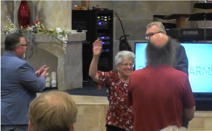
This lady was healed of a long-standing condition in her foot which affected her toe with great pain. Here she is testifying of her healing!