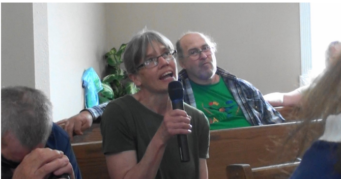
A word of knowledge was given for pain in the fingers. This lady went home without responding, but in the morning, she awoke with no pain, and here is testifying at Christian Way Fellowship